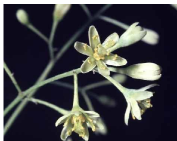
Fig 2: Flowers