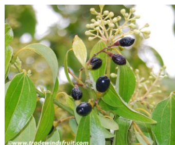
Fig 3: Fruits