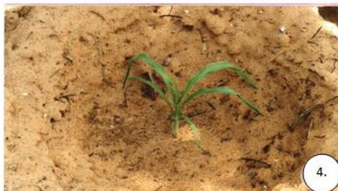
Fig.4: Photograph showing production of disease free (Resistant) plants transferred finally to soil.