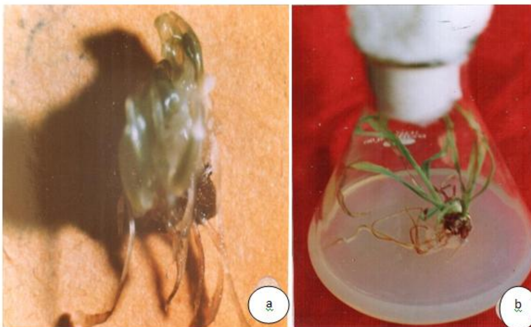
Fig.3: (a-b) Photograph showing root initiation on MS medium with IAA (2.5 mg/L). Complete plantlets with roots and shoots.