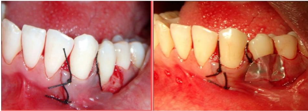
Figure 7: Pedicle Graft Is Stabilized With Sutures.