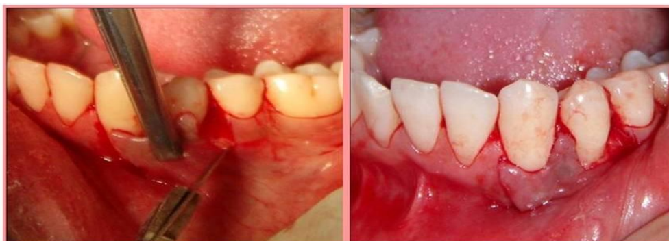
Figure 6: Lateral Pedicle Graft Rotated To Recipient Site.