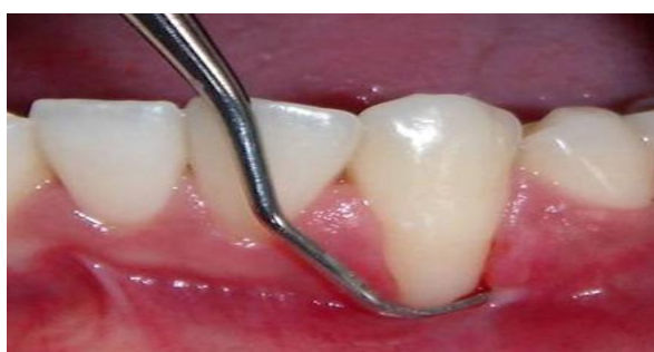
Figure 2: Gingival Recession after Oral Prophylaxis.