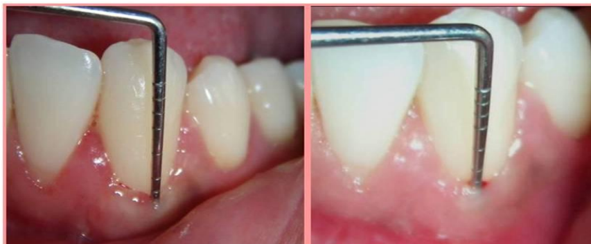
Figure 9: Post-Operative Photographs Of Three Months and Six Months of Surgery.