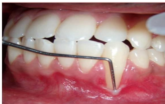
Figure 1: Mandibular Left Canine Showing Gingival Recession, Class II.

The patient was instructed regarding post-operative care of the surgical site. He was advised not to brush on the surgical area and instructed to use chlorhexidine gluconate mouthwash of 0.12% twice daily. Patient was also kept on a course of antibiotics. Sutures were removed after ten days of surgery and on examination surgical site showed complete coverage of the root surface. Oral hygiene instructions were reinforced. Patient recalled after one month and two months of surgery (Fig. 8) and also after three months and six months of surgery (Fig. 9). And the surgical site showed complete coverage and the donor site healed completely. The pedicle graft taken up on the recipient site with excellent colour matching with the adjacent area. The pedicle graft after one month, two months, three months and six months showed no signs of inflammation and it was firm and attached to the root surface.