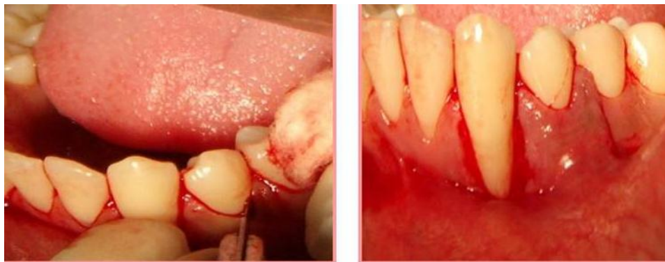
Figure 5: Lateral Pedicle Graft Taken From Adjacent Donor Site.