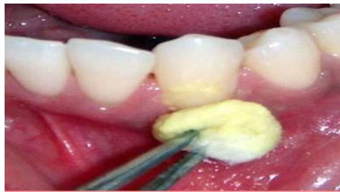
Figure 4: Root Conditioning With Tetracycline.