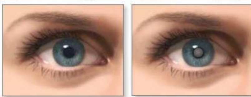
Figure 3: Normal lens and cataract