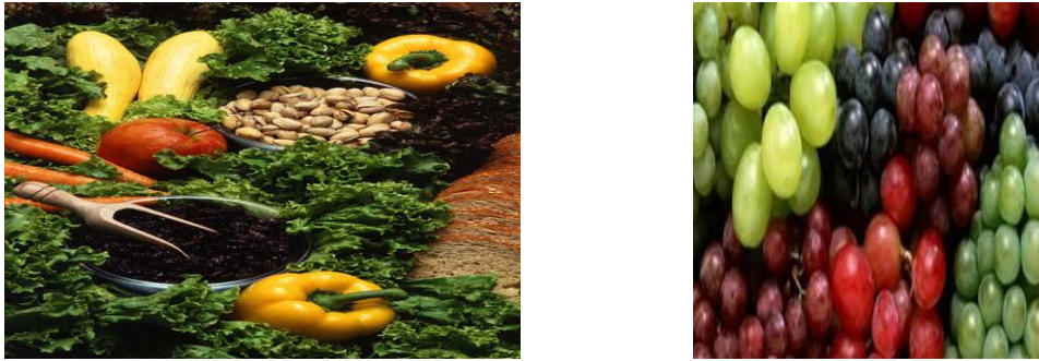
Figure 2: These foods are typical antioxidant.