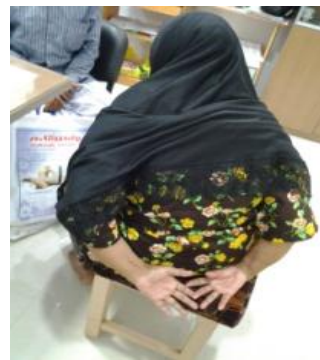
Figures 4: The extent of internal rotation of both shoulders of the patient at 2 year follow up.