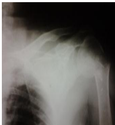
Figure 2: X-ray of the lady's right shoulder showing intact shoulder and fracture of surgical neck