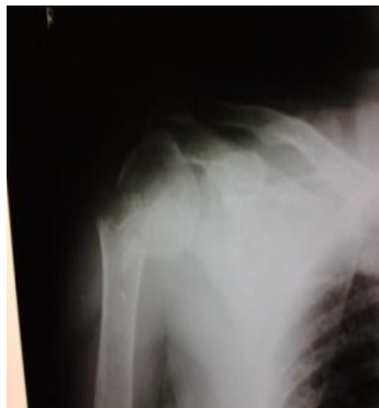
Figure 1: X-ray of the lady's right shoulder showing intact shoulder and fracture of surgical neck of humerus

From the clinical presentation and the X-rays she was diagnosed to have simultaneous surgical neck of humerus fractures. She underwent a CT scan of brain and facial bone which showed a fracture of nasal bone. Her CT of both shoulders showed fractures of surgical neck bilaterally. Her blood investigations including electrophoresis were normal. She was treated with bilateral arm slings and nasal Calcitonin spray- Ostospray®. She also had an Otonasolaryngologist opinion who advised conservative treatment for the nasal bone fracture. Functional assessment was done at two years after the initial presentation shown in figures 4 and 5. Her 2 year X-rays taken in abduction shows not only union but also the range of movement available [1-8].