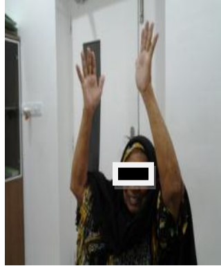
Figures 3: The extent of abduction of both shoulders of the patient at 2 year follow up.