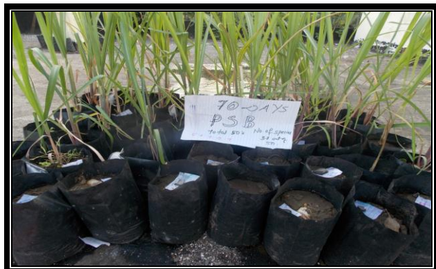
Figure 3 Phosphate Solubilizing Bacteria