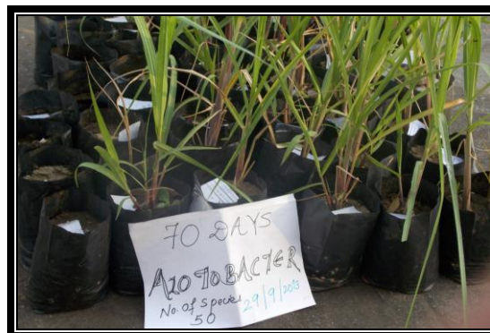
Figure 2 Azotobacter treated set