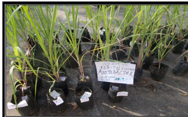
Figure 4 Trichoderma viridae + Azotobacter + PSB treated set

The germination percentage depicts the increased growth rate (Table.1). Tri. Viridae , Azotobacter , Phosphobacter individually showed decreased rate of growth compared to the applied combination of the biopesticides.