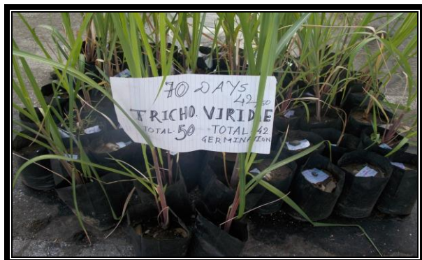
Figure 1 Trichoderma viridae treated set