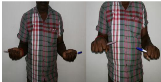
Figure 11: Clinical photograph showing forearm movements at 5 months follow up