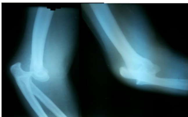
Figure 3: Anteroposterior and lateral radiographs of patient 2 demonstrating chronic elbow dislocation 12 weeks after the injury

Patient 2 is a 68 year old man who fell on his outstretched left hand and sustained injury to left elbow 16 weeks back. No specific treatment was taken by the patient. He was unable to move the left elbow and was not able to use the left upper limb since the injury. He had presented to our outpatient department. The 3 point bony relationship was altered, elbow instability present and no active movements were possible. Passive movements of 15 – 30° were present. Antero posterior and lateral radiographs showed chronic unreduced posterolateral elbow dislocation (Fig. 3)