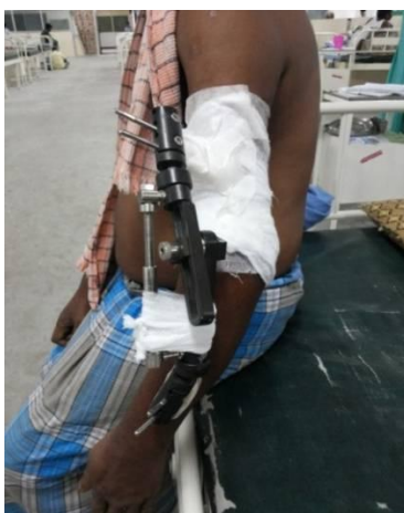
Figure 5: showing the LRS in situ in the process of distraction of the elbow joint