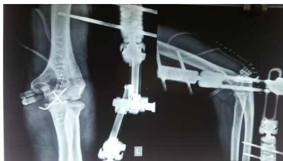
Figure 7: Anteroposterior and lateral radiographs showing reduced elbow with Kirshner wires in situ

To avoid heterotopic ossification and to reduce pain, indomethacin was prescribed 25mg bid with gastric protection for 2 weeks after the 1 st procedure. At follow-up, the range of motion of the elbow was recorded and the stability of the elbow joint tested on examination.