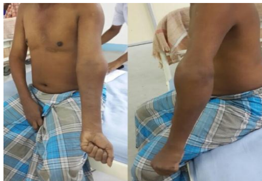
Figure 1: clinical photograph showing chronic dislocation of left elbow

Patient 1 is a 39 year old man who met with a road traffic accident and sustained a posterolateral dislocation of left elbow 20 weeks back. He had refused any form of orthopaedic treatment and had undergone treatment by a native bone setter in the form of bamboo splints, 4 times reapplied over a period of 16 weeks. After removal of the splint, he had deformity and stiffness of the elbow. He had presented to us, and the 3 point bony relationship was altered, elbow instability present, no active movements were presented. Range of passive movements was 30 – 50° (Fig 1). Anteroposterior and lateral radiographs showed posterolateral dislocation of the elbow (Fig 2).