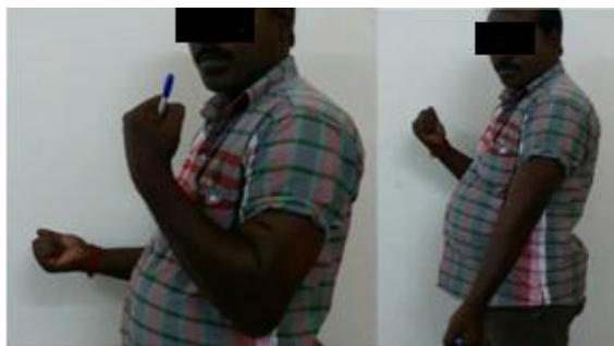
Figure 10: Clinical photograph showing the range of motion of elbow at 5 months follow up

No peri- or postoperative complications were recorded. No pin-site infections occurred. No re dislocation was recorded. The average period of follow-up was 5 months (6 and 4 months). Clinical examination at follow-up revealed no evidence of elbow instability. The average range of motion at follow-up was 0-120° flexion (125 & 115°) (Fig 10); forearm rotation was not restricted in any patient (Fig 11). No ulnar nerve dysfunction was observed. Radiographs at follow-up revealed concentric reduction and anatomic alignment of the ulno-humeral and the radiocapitellar joints in both patients. Mayo Elbow Performance Score (MEPS) shows Excellent results in both patients (Table 1).