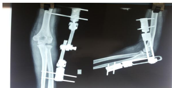
Figure 8: Anteroposterior and lateral radiographs showing reduced elbow after the Kirshner wires removal