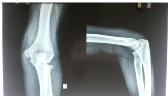
Figure 9: Anteroposterior and lateral radiographs showing reduced elbow after the removal of LRS

Radiographs in two planes were taken to assess articular alignment and post-traumatic arthrosis. Patients were evaluated using the Mayo Elbow Performance Score (MEPS) (Fig 13) [14] and the Disabilities of the Arm, Shoulder, and Hand (DASH) instrument [15] before the index operation and at final follow-up