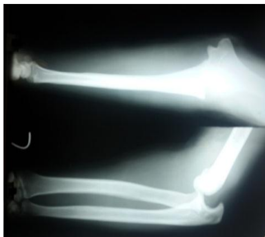
Figure 2: Anteroposterior and lateral radiographs of patient 1 demonstrating chronic posterolateral elbow dislocation 20 weeks after the injury.

Patient 2 is a 68 year old man who fell on his outstretched left hand and sustained injury to left elbow 16 weeks back. No specific treatment was taken by the patient. He was unable to move the left elbow and was not able to use the left upper limb since the injury. He had presented to our outpatient department. The 3 point bony relationship was altered, elbow instability present and no active movements were possible. Passive movements of 15 – 30° were present. Antero posterior and lateral radiographs showed chronic unreduced posterolateral elbow dislocation (Fig. 3)