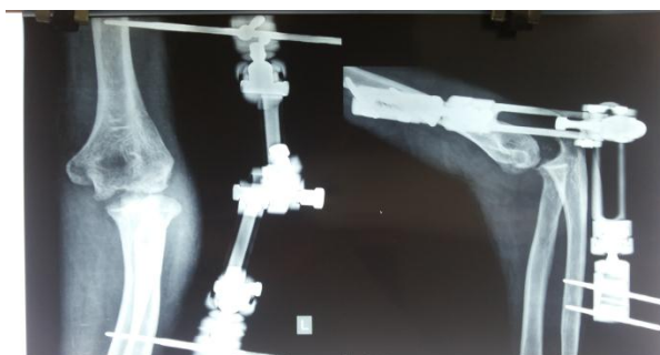
Figure 6: Anteroposterior and lateral radiograph showing the LRS in situ

After 2 weeks of the 1 st procedure, patient was posted for open reduction through a midline posterior incision and Vshaped cut of the triceps done.