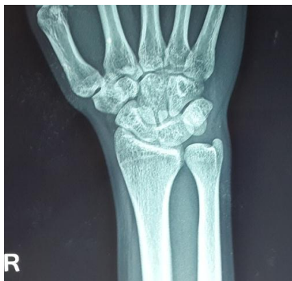
Figure 1: right AP wrist Radiograph appears normal