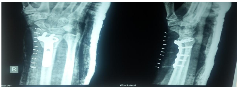
Figure 3: right AP and lateral view showing post op 3mm radial shortening