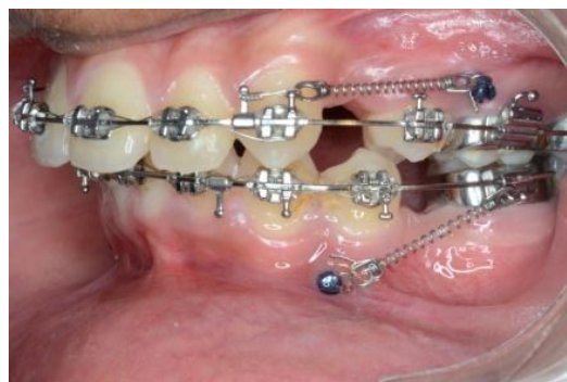
Figure 5: Retraction by Implants

In cases of dental bimaxillary cases where maximum posterior teeth anchorage is of prime importance, Implants are of great consideration. With the introduction of dental implants, as anchorage units, it is possible to close the extraction spaces completely by anterior tooth retraction with absolute anchorage of the posterior teeth [8]. (Figure 5).