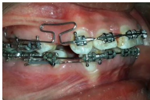
Figure 2: Activated T loop placed between canine and premolar for enmasse anterior retraction

Orthodontic load system of ideal moment-to-force ratio is the commonly used design parameter of segmental T-loops for canine retraction. But the load system, including moment- to-force ratios, can be affected by the changes in inter-bracket distances and changes in the canine angulations [5].