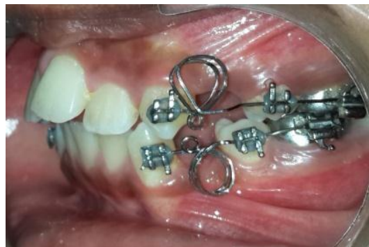
Figure 3: Activated PG spring for retraction of canine

Sectional arch technique facilitates creation of an optimal force system to fulfill the biomechanical requirements for planned tooth movements. During the retraction, for controlled canine retraction, in extraction cases, it requires the creation of a biomechanical system to deliver a predetermined force and a relatively constant moment-to-force ratio to avoid distal tipping and rotation. To avoid any unwanted side effects and undesirable changes in the occlusal plane, the responsive couple delivered to the anchorage unit should be adjusted well. A PG Universal canine-retraction spring is constructed from 0.016 x 0.022 inch stainless steel wire, a double ovoid loop of 10 mm being the principal element. A “sweep” bend should be incorporated to avoid any unwanted side effects at the second premolar [6]. The spring is activated by pulling distal to the molar tube until the two loops separate (Figure 3).