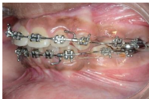
Figure 1: Sliding mechanics

In friction mechanics, for bodily movement, there is no need to apply a balancing moment. The appropriate moment is applied via continuous arch wire to the teeth that passes through the brackets (Figure 1). When force is applied through a continuous arch wire passing through brackets, it undergoes a cycle of events. Example, on canine first there is controlled tipping then translation then root movement. The moments are delivered via couple forces, equal and opposite non-collinear vertical forces, at the mesial and distal bracket extremities. First the canine will tip distally until the diagonally opposite edges of the bracket slot contact and bind with the arch wire and produce a couple to upright the root. The magnitude of the moment is determined by the width of the bracket, wire size, shape and alloy. The moment to force ratio changes as the tooth moves from controlled tipping to translation to root movement. To predict accurate moment to force ratio it is difficult as the wire bracket friction is a variable factor [2].