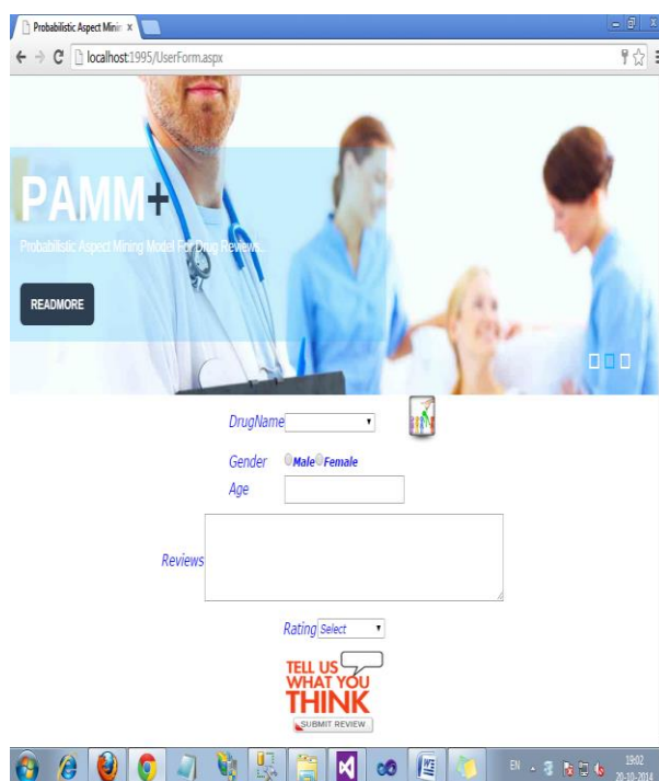
Figure: 4 Review Submission

The figure4 shows Review Submission. In Review Submission, the user gives drug name, gender, age, reviews and rating for the product.