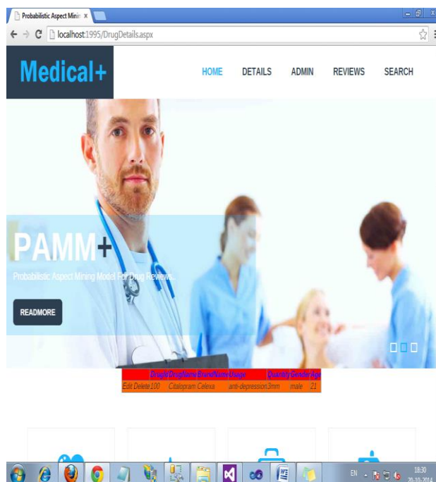
Figure: 2 Drug Details

The figure2 shows Drug Details. The admin have to store the drug, brand name and quantity details in database.