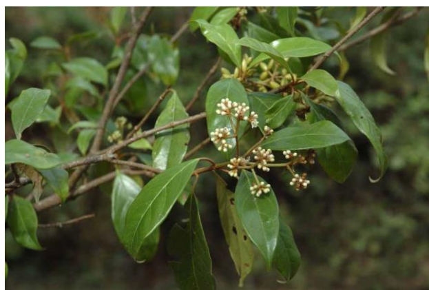
Figure 1: The Plant Viburnum Punctatum

The present study on the medicinal plant namely Viburnum punctatum belongs to the family Caprifoliaceae and this plant is small trees, monotypic genus Viburnum , native to India, Indonesia, Bhutan, Cambodia, Nepal, Thailand, Vietnam and China. Asian Viburnum features dainty lymes of creamy white flower at the ends of the branches from early to mid-spring. It has dark green foliage throughout screen. The red fruits are held in abundance in spectacular clusters in mid-summer, expected to live for 40 years or more [3, 4]. The leaves were traditionally used for the treatment for fever, stomach disorder and mentioned to possess antiperiodic effect. The preliminary phytochemical investigation shows presence of flavonoids, alkaloids, glycosides, phenolic compounds, phytosterols and saponins [5, 6].