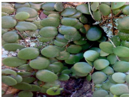
Fig 1: Herbal of dragon scales

The leaves of dragon scales are 2-5 cm long, dark green color, round to oval shapes. The stems and roots are dark brown color (Fig 1). This study was used 7.5 kg of dragon scales leaves, then dried to produce 800 g of dried leaves. Water content of dried leaves was 4.3%, which met the criteria, i.e. 10% [14].