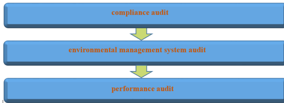
Figure 1: Stages of environmental audit in the United States

There was a need to use methods that would allow not only to create a company a positive reputation in the eyes of the public and consumers but, above all, to ensure compliance with the requirements of environmental legislation. To this end, many companies began to carry out comprehensive inspections of production activities, taking into account the “environmental factor”, based on the principles of financial auditing. Such a scheme describes the classical and original forms of an environmental audit, as it appeared in the 1970s in the American industry. It is believed that the environmental audit in the world originated at the turn of the 1970-1980s (Figure 1).