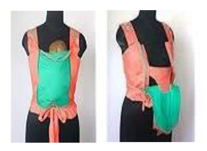
Figure 2: Commercially available KMC sling bags