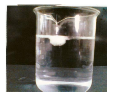
Fig .2 Floating of tablet after 12 Hrs