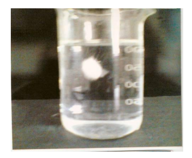
Fig .1. Floating of tablet after 45 sec.