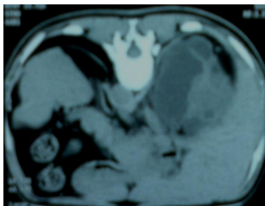
Fig 1: CT- Abdomen showing left perinephric abscess

A 48 year-old male weighing 62 kilograms presented with complaints of burning in micturition and low grade fever (off and on) since 1 year along with right flank pain since 3 months. A tender ballotable lump was palpable on right side of abdomen. Total leukocyte count was 9100/cu mm and serum creatinine was 3.62 mg/dL. During evaluation, glycemic status of the patient was found to be deranged. USG abdomen was suggestive of a small abscess cavity in posterior aspect of right kidney with a thin rim of collection around lower pole. The other kidney was found to be small and contracted. CT abdomen (Fig.1) was suggestive of a localized collection in medial aspect of right kidney with extension in perinephric space superiorly & laterally.