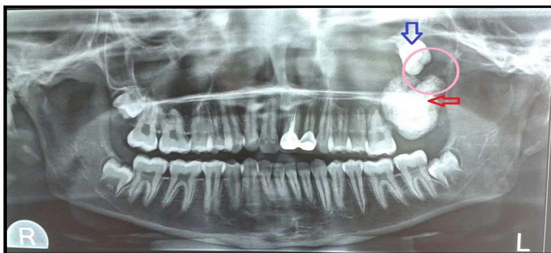
Radiographic Picture (OPG) showing large odontome (Red arrow) impacted third molar (Blue arrow) and associate radiolucency (Pink circle)

Orthopantomography revealed the presence of a radiopaque mass distal to the maxillary left first molar extending up to maxillary tuberosity region, measuring about 2x4cm. An impacted third molar tooth was noted in inferior border of the orbit. Small radiolucent area was noticed in association with the crown of the impacted teeth and apical area of the radiopaque mass. On the basis of clinical and radiological findings, a provisional diagnosis of complex odontoma was established.