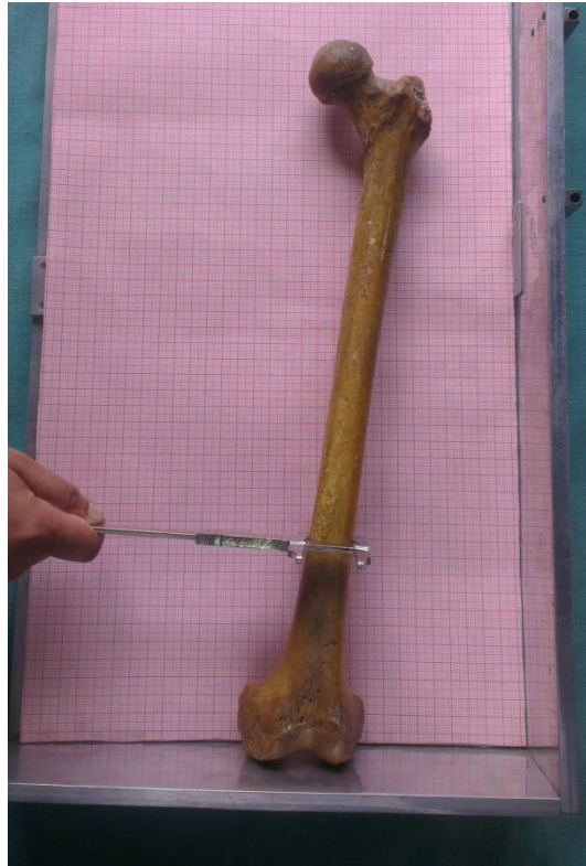
Figure 2. Measuring the maximum diameter of the shaft at about 25% of the standard maximum length from the distal end.