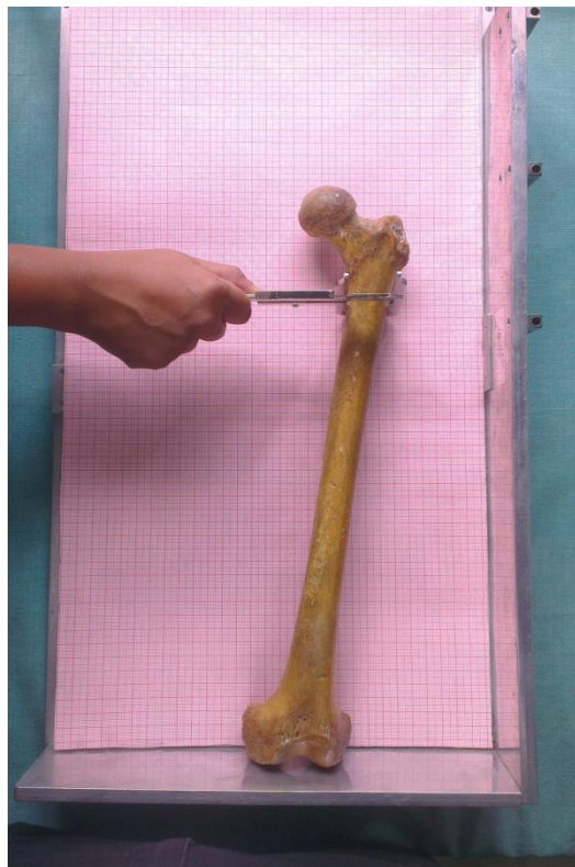
Figure 1: Measuring the maximum diameter of the shaft just below the lesser trochanter .