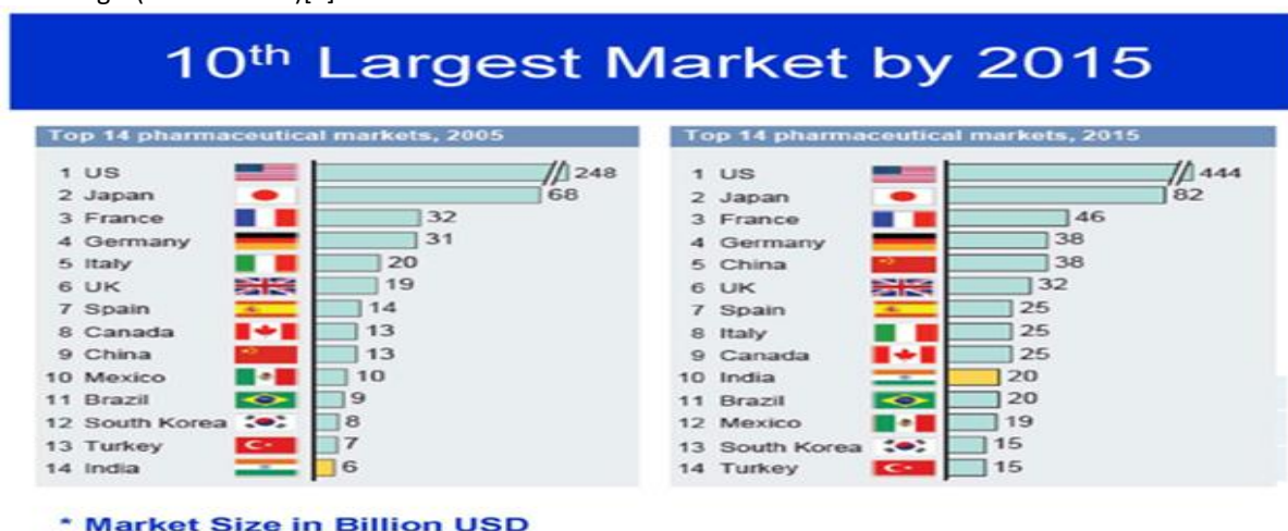
Exhibit No: 2

Indian Pharmaceuticals sector is classified into Bulk drugs, Formulation and Contract Research and Manufacturing Services (CRAMS). The drug and pharmaceuticals industry in India meets around 70% of the country's demand for bulk drugs, drug intermediates and formulations. There are about 500 corporate players with more than 20000 players in general and thus fragmented Indian pharmaceutical industry. The bulk drugs and pharmaceuticals manufacturers produce complete range of pharmaceutical formulation and about 350 bulk drugs. (Exhibit No: 2)[5]