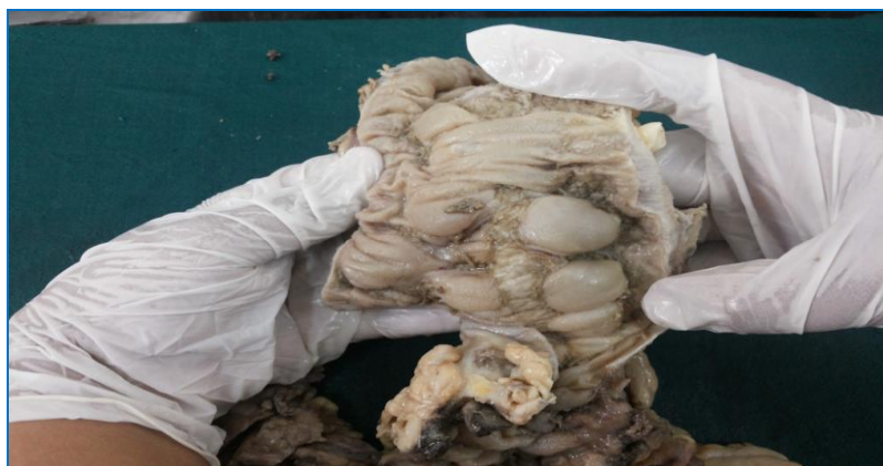
Figure 2 shows colonic mucosa with plaque-like lesions and edema