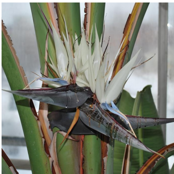
Figure 1. Flowering of Strelitzia nicolai

The seasonal development rhythm of S. nicolai and S. reginae in a greenhouse does not have a pronounced dormant period. The highest intensity of new leaves development was observed in the spring and in the summer, and the lowest - in the autumn, in the period between the end of fruit ripening and the beginning of stem growing. Specimens of S. nicolai can grow in the soil of a greenhouse and in pots, but potted plants do not bloom. Regular flowering occurred only on the stems that grow in the ground, and had reached the height of 6-10 m. The specimens of S. reginae were also grown in greenhouses in the ground and in pots. The specimens that grew in the ground were 4-5 times more powerful and bloomed more abundantly, as compared to the specimens grown in pots. The height of plants (leaves) was 1-1.5 m.