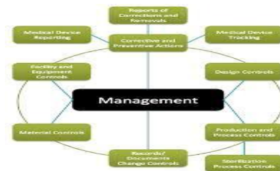
Fig.1: Management architecture

It is difficult for electronic healthcare systems to have an understanding of the understanding contents of the unstructured and narrative texts with no trouble on the grounds that they are composed of heterogeneous grammatical buildings, diversified expressions expressed in various common languages as well as using diverse phrases to denote a single concept. Therefore, the healthcare domain is characterized by means of ambiguity. Hence, the accessibility to valuable and significant healthcare expertise for prognosis and healing in a timely manner becomes a undertaking [1]. Accordingly, the healthcare procedure is characterized by excessive fee and excessive error charges. Nevertheless, ordinary Language Processing (NLP) strategies have been used to structure know-how in healthcare systems by extracting valuable information from narrative texts so that you could furnish information for determination making. For this reason, NLP approaches minimize healthcare fee and they are additionally large for the development of healthcare approaches. It's for that reason in contrast historical past that this paper examines NLP procedures utilized in healthcare, their importance to the healthcare domain as good as their boundaries in healthcare.