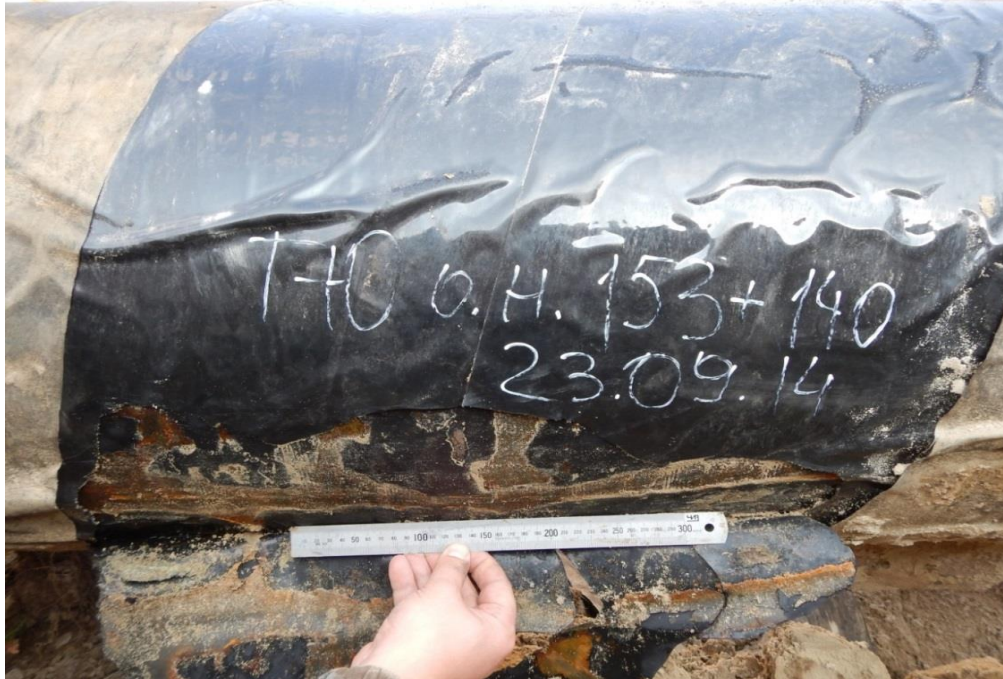
Figure 4: Check pit on the pipeline T-Yu made based on the results of the diagnostic test.

The only disadvantage of this method, identified empirically, was the worst (as compared with a perpendicular arrangement MEA) accuracy in determining the location of the defect. The mistake was in the range of \pm 5 m. However, if a defect is detected, it is sufficient to carry out additional measurements with the removal of the electrode perpendicular, which will increase accuracy up to \pm 1 m.