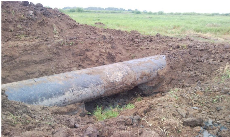
Figure 2: Check pit on the pipeline UBKUA made based on the results of the diagnostic test.

Later on, during examination, the modified scheme of measurements was applied in some areas to clarify the data. External electrode (EE) with 5-10 meter step was placed not perpendicular but parallel to the axis of the pipeline. The results of comparison of the data obtained are shown in Table 1.