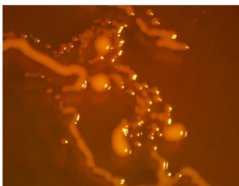
Fig 1: EPSs (exopolysaccharides) produced by L. plantarum Ts cultivated in a media containing 10% sucrose, which are secreted in the culture medium.

The presence of EPS associated with bacterial cells can be recognized by the formation of colonies in mucous solid medium (Stadler R, et.al., 2010). Colonies showing a slimy appearance were picked and subcultured in mMRS with 10% sucrose and incubated for 2 days at 37°C. Totally nine isolates were collected from the ganjang samples. Therefore, the presence of a translucent or creamy material involving a mucoid colony is indicative of EPS production potential. When cultivated in a media with high content of saccharides such as 10% sucrose solutions, strain L. plantarum Ts synthesizes exopolysaccharides (Fig. 1).