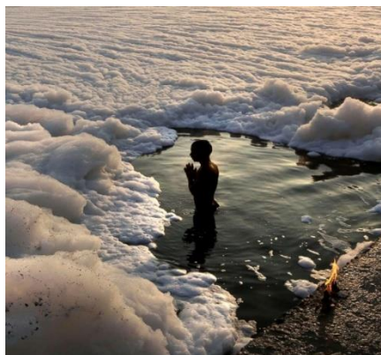
Fig 1: Surfactants polluting rivers.

disposal and subsequent exposure to the environment. Surfactant synthesis critically affects the environment aggravating the problems related to global warming, climate change, ozone layer depletion and greenhouse gas emission which cannot be totally avoided. Both petrochemical or oleo chemical based surfactant production results in atmospheric emission, water borne wastes and solid waste, causing eutrophication of rivers and lakes (Fig. 1).