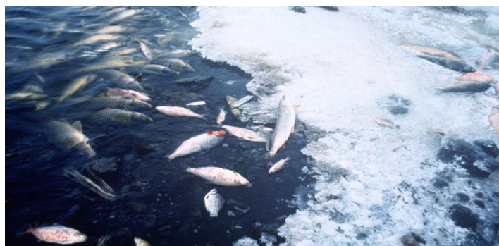
Fig. 3: Surfactant effect on Fishes.

The permissible levels of surfactants were reported to be 0.1 mg/L. Adverse biological effects on aquatic organisms occurred at relatively higher concentrations of surfactants [22]. When the concentration of surfactants increases in water bodies, they enter the gills, blood, kidney, liver, spleen and intestine of fishes. High concentration of surfactants caused death of fishes by reducing the swimming capacity of fishes (Fig. 3). Exposure to surfactants causes acute inflammatory reactions, oxidative stress and damage to mucus layer of fishes[36]