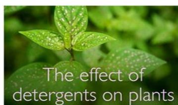
Fig 2: Surfactant affected plant leaves.

Mild concentration of surfactant was observed to alter the soil properties whereby sorption process plays predominant role. The roots of plants were suppressed or killed by the surfactants. Reduced photosynthetic activity and decreased chlorophyll (Fig. 2) were also reported by the use of detergent contaminated water [6].