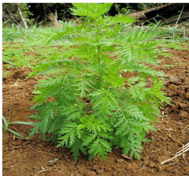
Figure 1: Artemisia Annua